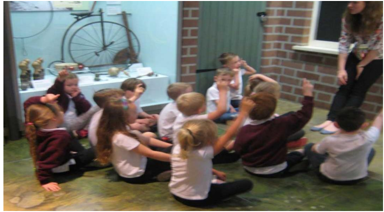
Thank you to all our helpers who travelled and assisted the pupils during the trip.

Year 1 have been busy learning about multiplication this half term, using lots of different things to help them.